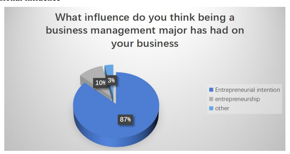
Figure 3 Impact of business management learning on Entrepreneurship

More than 80% of the students majoring in economics and management think that the willingness to start a business has the greatest impact on their economics and management major. Knowledge is a valuable asset in life. Without entrepreneurial knowledge, the road to start a business will be more difficult. Entrepreneurship, for many people, is to create a career and be their